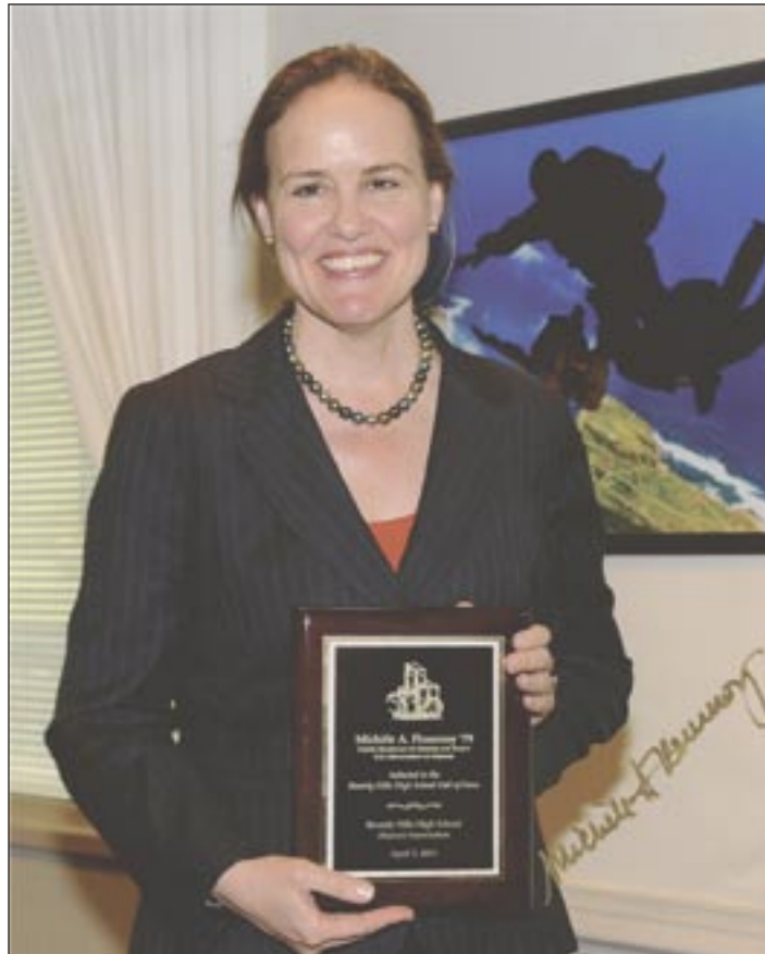
Michele Flourney '79

Prior to joining NDU, Flourney served as a senior-level political appointee in the Department of Defense during the presidency of Bill Clinton, working at the Pentagon where she occupied the dual roles of Principal Deputy Assistant Secretary of Defense for Strategy and Threat Reduction and Deputy Assistant Secretary of Defense for Strategy. In those capacities, she oversaw three policy offices in the Office of the United States Secretary of Defense: Strategy; Requirements, Plans, and Counterproliferation; and Russia, Ukraine, and Eurasian