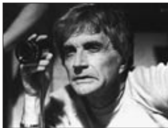
Blake Edwards W'41

Edwards started out as an actor in the early 1940's and worked with well known directors such as William Wyler, Otto Preminger and others. He came to realize that he wanted to give direction and not take direction. His service in the U.S. Coast